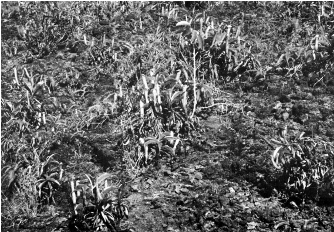
N. mirabilis on Yap Island, December, 1987.

The variety of species encountered in the Pacific islands declines as you move from the Asian mainland. Hawaii, for example, has only 1/2 to 1/3 as many species as is found in Palau. Fosberg, et al. (1979) listed the presence of Nepenthes mirabilis in the Palau group on Babeldaop, Koror, Ngarakabesang, Malakal, Aulupse'el, Urukthapel, and Orokuiza; and in the Yap group on Yap. Drosera burmannii and D. spathulata were found only on Babeldaop. Utricularia bifida was reported on Babeldaop and Koror, Yap, and Guam; U. caerulea on Babeldaop and Guam; U. racemosa on Koror; and U. ulginosa on Babeldaop. Stemmermann and Proby (1978) have published detailed location maps of their vegetation sites. Their paper also contains photographs of U. bifida and U. nivea on Palau, and N. mirabilis on Yap. It would be interesting if someone were to take a detailed look at the