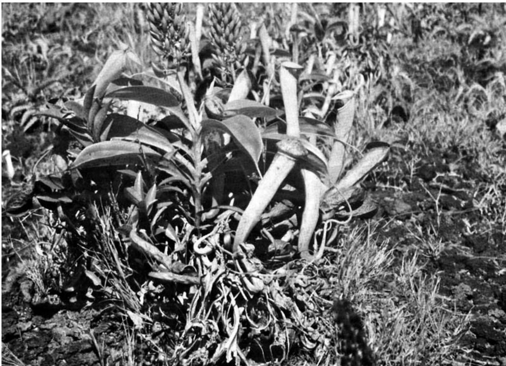
Close up of female N. mirabilis on Yap Island.

On Palau, N. mirabilis is called "Meliik"; on Yap, it is called "Youaad", or more commonly, "tafene fii ko borro", literally "the place that rats pee." It is thought that the pitchers contain rat urine, perhaps because of the odor of decaying insects. One of the local village employees of the Yap Institute of Natural Sciences who accompanied me in the field was surprised that there was water in the new, unopened pitchers, and wondered how it got